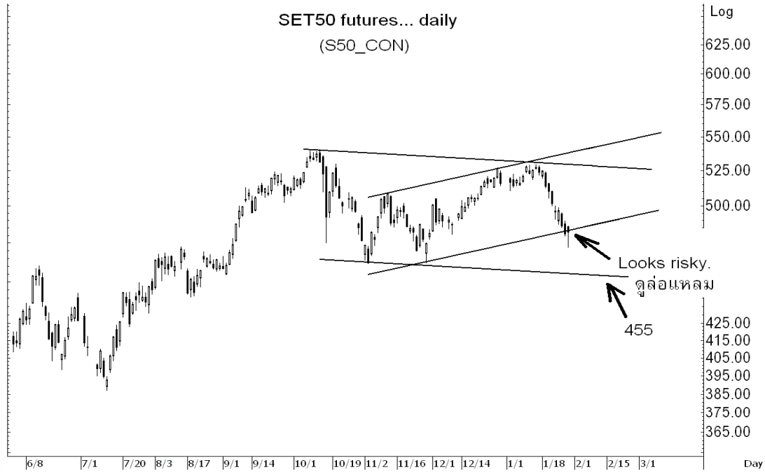
Figure 1: Technical Analysis

ทาง Technical, ถือที่ Short เพิ่มไปแล้ว เพื่อเส็งลงไปแบ่งทำกำไรอีกรอบที่ 460-455 โดย stop ขอดูจนปิด