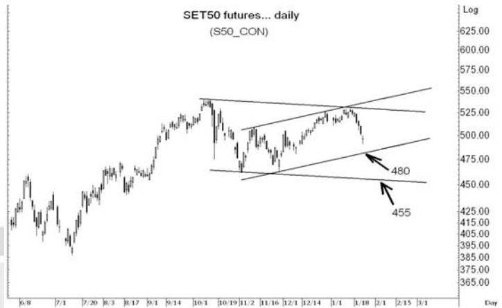
Figure 3: SET50 Futures Premium