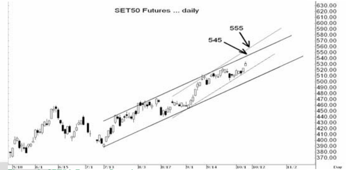
Figure 3: SET50 Futures Premium