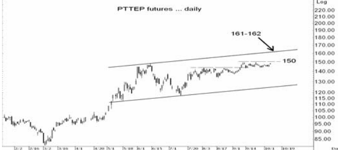
Figure 4: PTTEP09 Futures