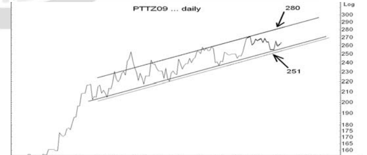
Figure 5: PTT09 Futures