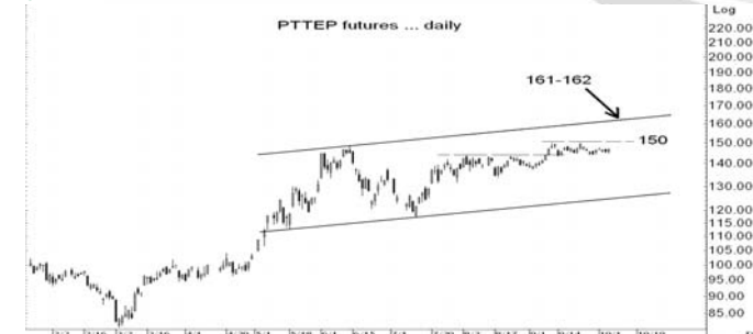
Figure 4: PTTEP09 Futures