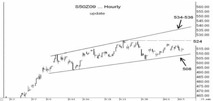
Figure 1: Technical Analysis