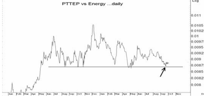
Figure 4: PTTEP vs Energy Sector