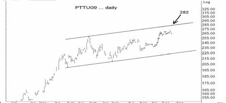
Figure 5: PTTU09 Futures