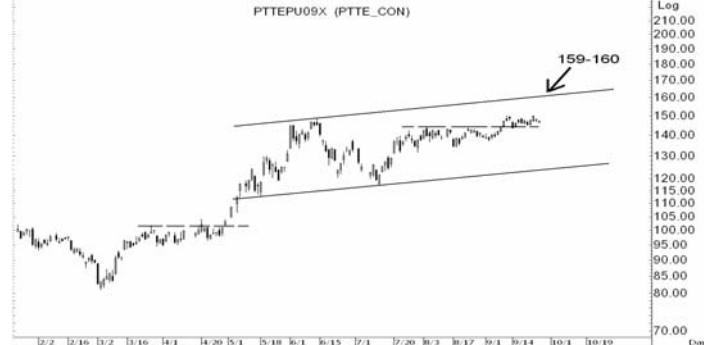
Figure 4: PTTEP09 Futures