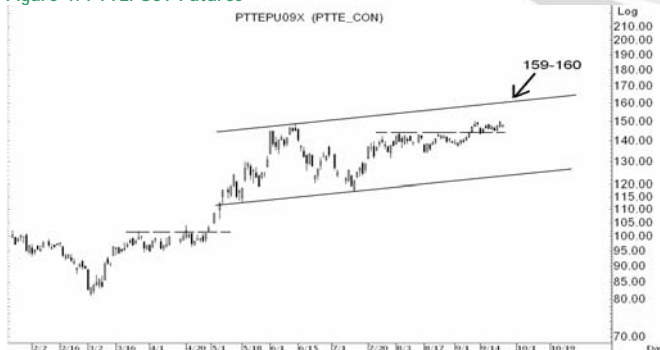
Figure 4: PTTEPU09 Futures