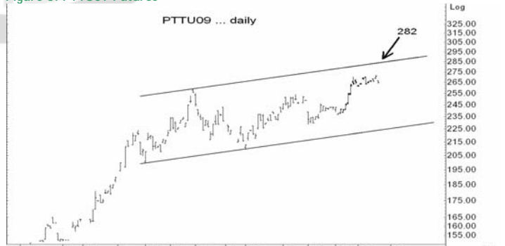
Figure 5: PTTU09 Futures