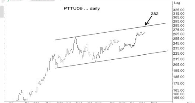
Figure 5: PTTU09 Futures