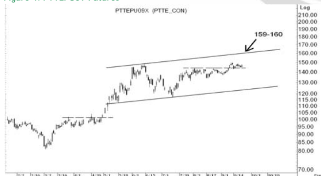
Figure 4: PTTEPU09 Futures