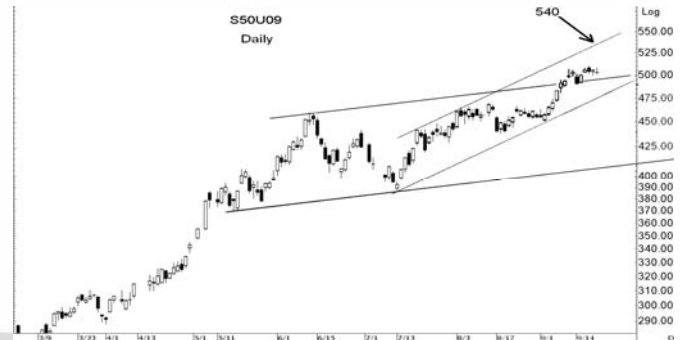
Figure 1: Technical Analysis