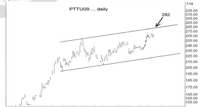
Figure 5: PTTU09 Futures