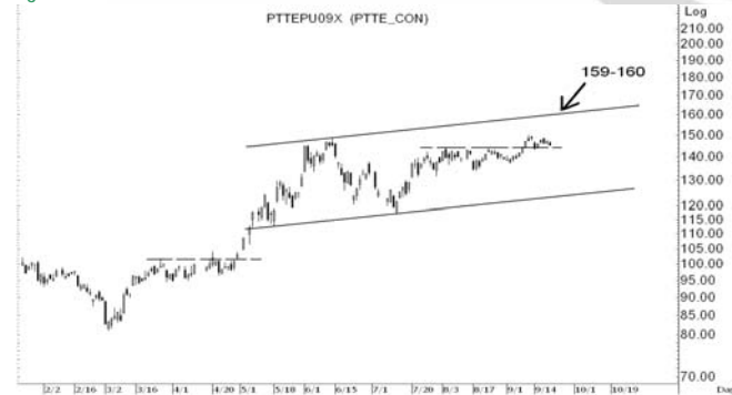
Figure 4: PTTEPU09 Futures