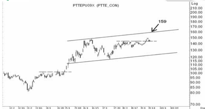
Figure 4: PTTEPU09 Futures