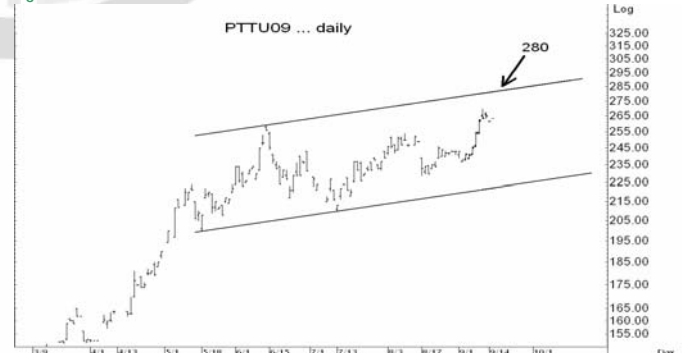
Figure 5: PTTU09 Futures