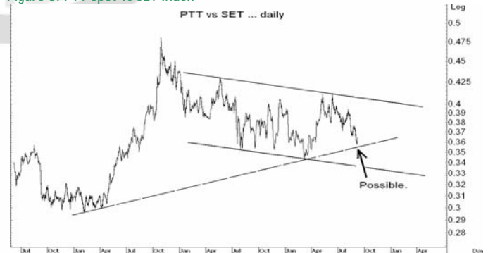
Figure 5: PTT Spot vs SET Index