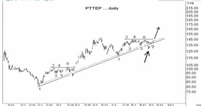
Figure 4: PTTEP Spot