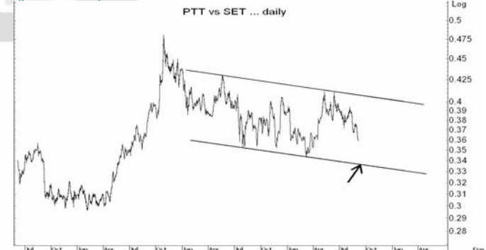
Figure 5: PTT Spot vs SET Index