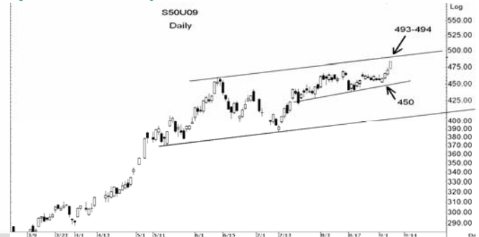
Figure 1: Technical Analysis