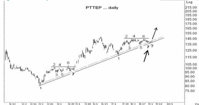
Figure 4: PTTEP Spot