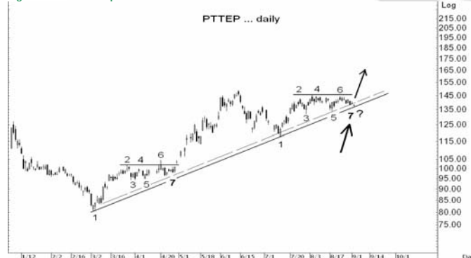
Figure 4: PTTEP Spot