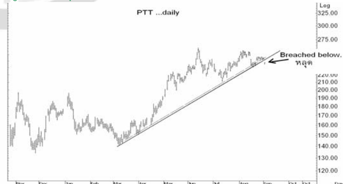
Figure 5: PTT Spot