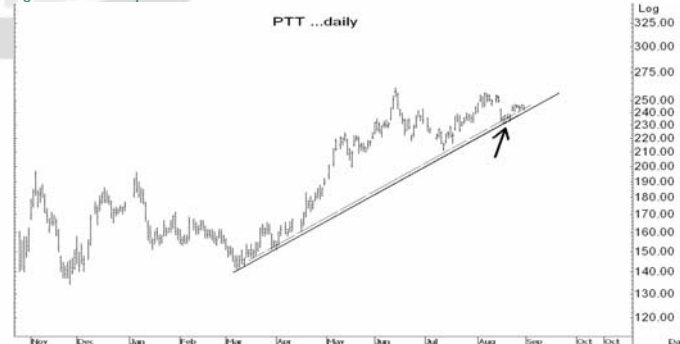
Figure 5: PTT Spot