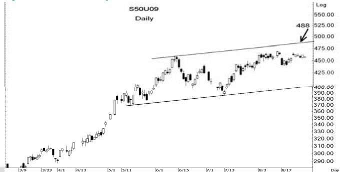
Figure 1: Technical Analysis