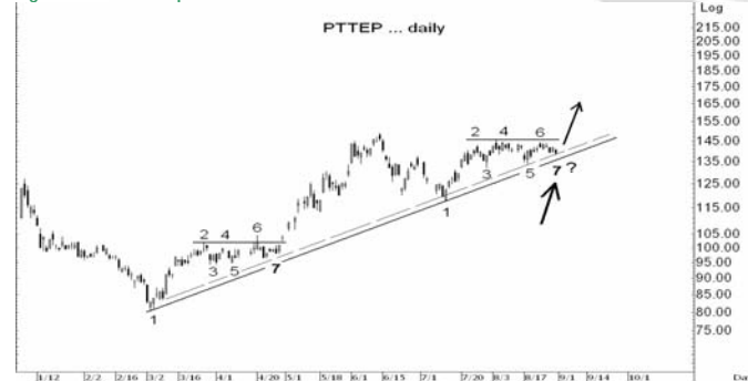
Figure 4: PTTEP Spot